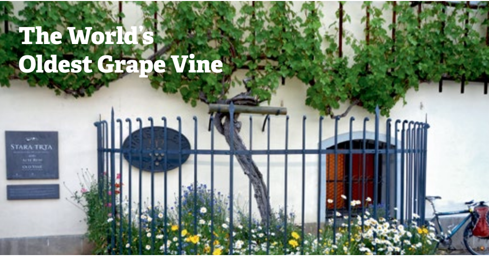
The World's Oldest Grape Vine